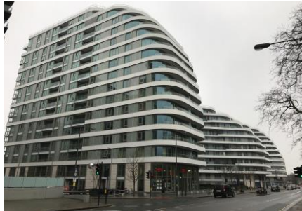
View from Queenstown Road