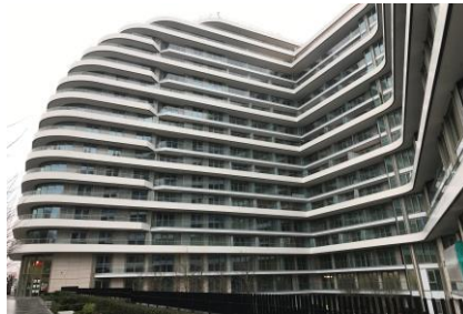
View from Sopwith Way

The Vista Development comprises the delivery of approximately 452 units over two buildings, Block C at the North of the Site and Block L at the South, along with ground floor retail and associated car parking.