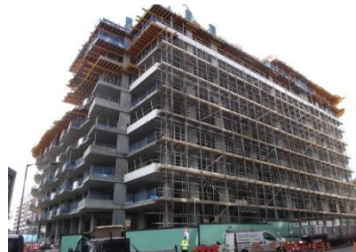
Balcony panel installation is progressing and currently on Level 8 (cores 1 & 2)

The Vista Development comprises the delivery of approximately 452 units over two buildings, Block C at the North of the Site and Block L at the South, along with ground floor retail and associated car parking.