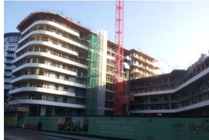
Block C has progressed on to the 8 th floor on Cores 1 & 2

Please visit our website for updates: http://www.vistaconstruction.co.uk/ Berkeley seek to minimise disruption during construction works as much as possible. This newsletter will be emailed to all interested surrounding residents to provide regular updates and key information on the Vista project. Should you wish to be added to the email database please email jamie.street@berkeleygroup.co.uk