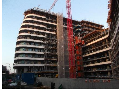
Block C has progressed on to the 12 th floor on Cores 1 & 2

Please visit our website for updates: http://www.vistaconstruction.co.uk/ Berkeley seek to minimise disruption during construction works as much as possible. This new sletter will be emailed to all interested surrounding residents to provide regular updates and key information on the Vista project. Should you wish to be added to the email database please email jamie.street@berkeleygroup.co.uk