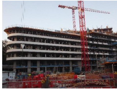
Balcony panel installation is progressing and the Hoist is up to Level 7.

The Vista Development comprises the delivery of approximately 452 units over two buildings, Block C at the North of the Site and Block L at the South, along with ground floor retail and associated car parking.