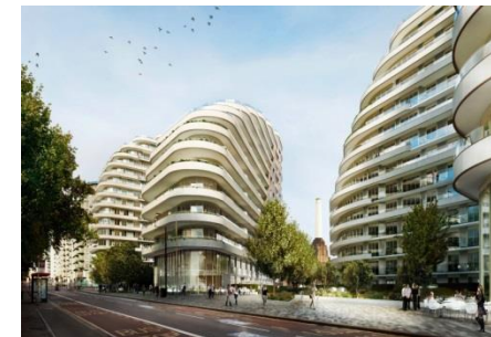
Vista CGI – View NE from Queenstown Road