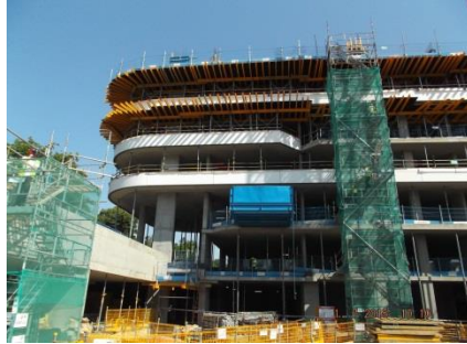
Block C has progressed on to the fifth floor on cores 1 & 2

For all construction & site queries contact: Barry McDonagh on 07824417709 Jamie Street on 07917593071