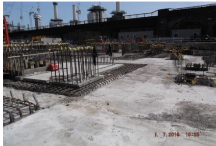
The foundation on Block L have been completed